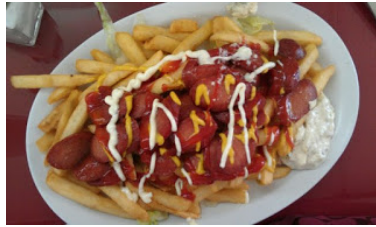
Salchipapas – everyone's favourite post-nightclub snack.

20. You get lomo saltado cravings at lunchtime and salchipapa cravings after a night out (and ceviche cravings at least once a week).