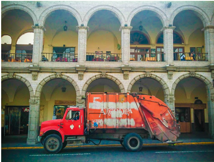
The rubbish trucks announce their arrival with all kinds of interesting music

1. The rubbish trucks brighten up your day by playing 'Under the Sea' (or other amazing songs!). When you go back home, rubbish collection day loses all its magic.